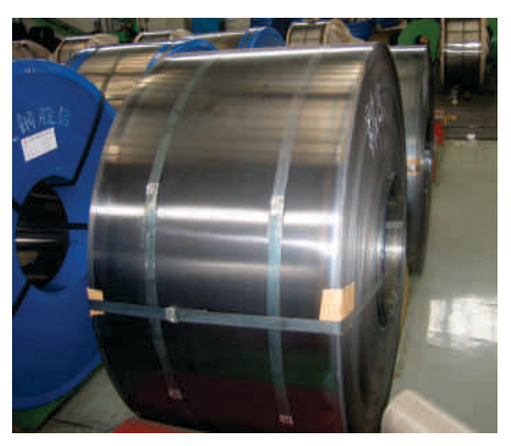
Imported cold-rolled coils at the Chennai warehouse

Continuing the impact of the fourth quarter of the last financial year, FY 2011 – 2012 began with high Indian steel prices, which remained stable through April and May, but due to fall in raw material costs, they have again started moving southwards. As we move towards the end of the quarter, even the Chinese steel mills have cut prices for July shipments.