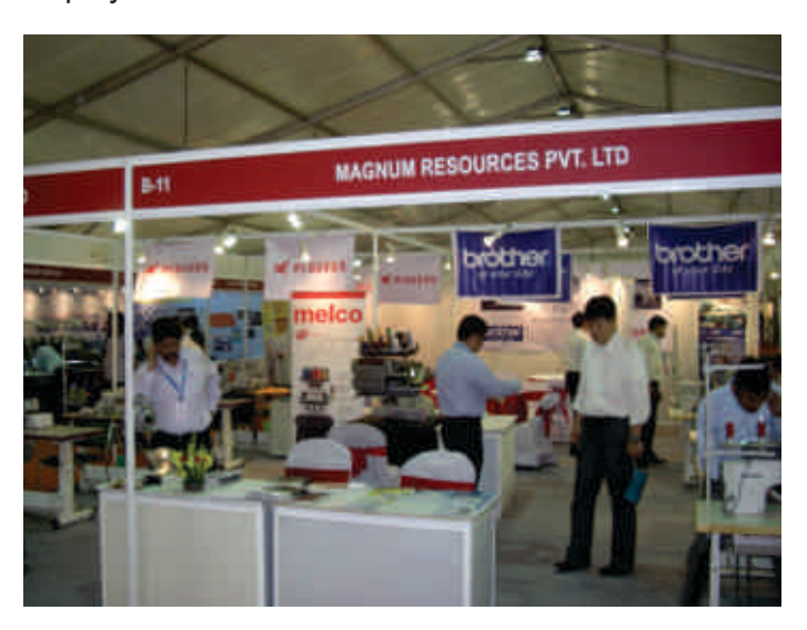
The MRPL Team at the GTE - 2011 in Jaipur

The quarter also saw Magnum participating in Garment Technology Expo 2011 in Jaipur for the first time from 14th to 16th May. Sewing machines from Pegasus and Brother and Amaya machines were displayed in the exhibition.