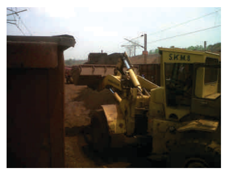
Domestic Supplies for Iron Ore are held up as of now

Our trading of FOB iron ore cargoes remained solid and we delivered on our targets. We see this business growing for the company and are now looking at expanding to newer ports including West India.