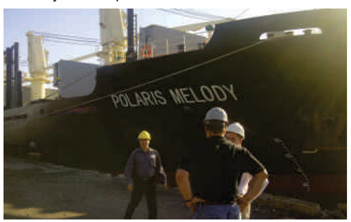
MV Polaris Melody at the Load Port in US

Owing to a severe paucity of good quality coal supplies domestically, India remains particularly vulnerable to the pricing tactics of foreign suppliers, especially from Australia. But, in spite of restricted availability of Australian Hard Coking Coal on spot, the Indian market is not very upbeat due to sluggish demand in the downstream sectors like Pig Iron, Sponge Iron and others and this has significantly impacted the Indian Met Coal & Met Coke Prices. Hopefully the market should witness some signs of recovery from September 2011 onwards.