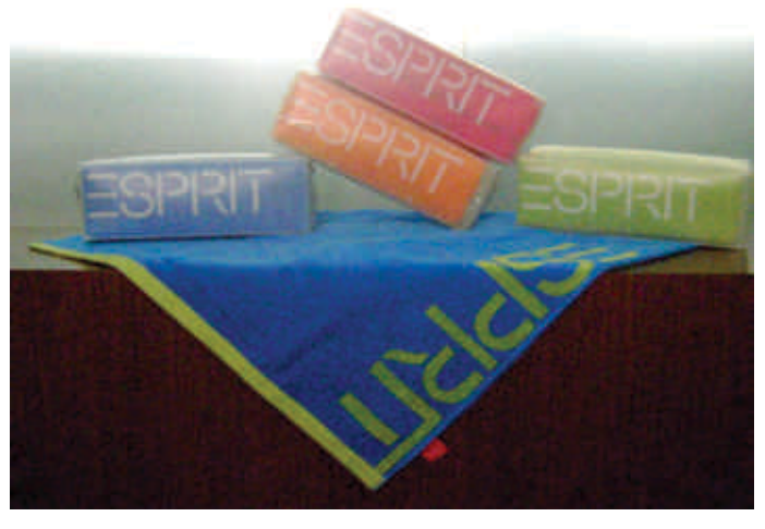
Sara Sourcing's first dispatches to South America

Jute market continues to be low as Bangladesh is giving quality products at cheaper prices as compared to India. We are monitioring the situation and will do forward bookings when we have new crops in the next season.